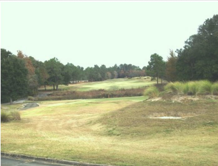
12.9 Ac Outparcel