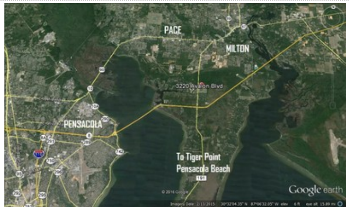
Esc SRC 1a